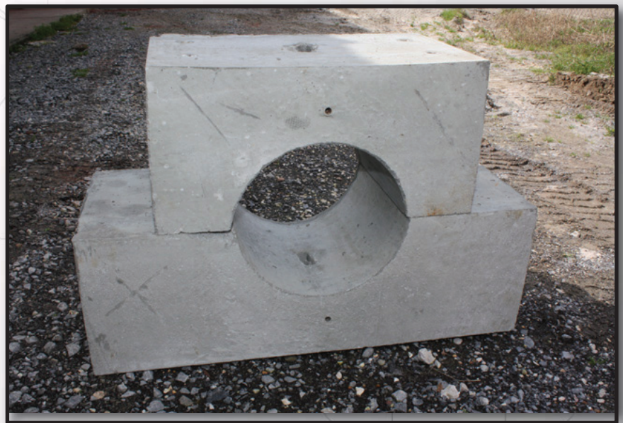
Precast Concrete Bolt-On Pipe Weight for 12” HDPE Wastewater Pipeline