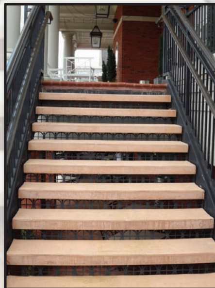
Century Custom Colored Open Riser Stair Tread