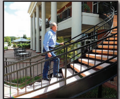
Century Custom Concrete Stair Treads in Spiral Staircase