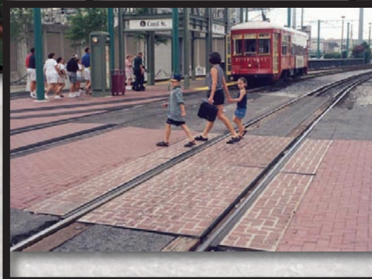
Precast Concrete Railroad Grade Crossings