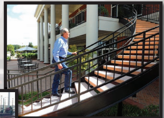
Precast Concrete Stair Treads