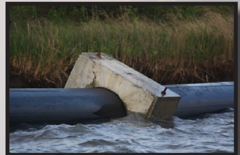
Century Precast Concrete Pipe Weight on Dredge Spoil Discharge Pipe

No matter how demanding or complicated your pipeline project may seem, Century Group is up to the task of furnishing quality, state-of-the-art precast concrete pipeline weights for your project. From standard pipeline weights to those custom designed, Century Group can deliver on time. For more information on Century precast concrete pipeline email the Century Group Precast Products Division or call 1-800-527-5232, Ext. 165.