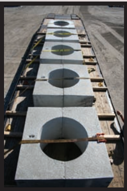
Precast Concrete Pipe Weights