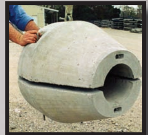
Round Conical Bolt-On River Weight

Because the Century concrete bolt-on and set-on pipeline weights are precast there are no surprise cost increases due to unstable weather conditions and other jobsite interruptions and delays when attempting to build them onsite. The pipe weights are ready to install when they reach the jobsite and can be easily set using safe and approved lifting slings supplied by Century Group. If the project is time sensitive, the pipe weights can be manufactured in advance of the actual onsite startup of the project and be ready for shipment as soon as personnel and equipment is mobilized to the jobsite. Century Group has five manufacturing facilities located in the U. S. which helps minimize cost of freight to your project site.