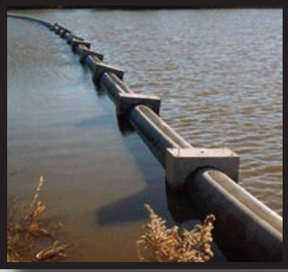
Bolt-On Pipeline River Weights

Century Group Inc. also provides custom designed precast concrete bolt-on or river weights for pipeline projects which transcend waterways such as rivers, streams, bays, lakes, commercial waterways and wetlands which have unstable bottoms/substrates. The bolt-on pipe weights can be manufactured in various sizes and shapes and are designed to allow for gasket material to be used to provide a protective layer between the pipe and the pipe weight. Century Group also uses either galvanized or stainless steel bolts and washers to ensure long term durability of the connection fittings.